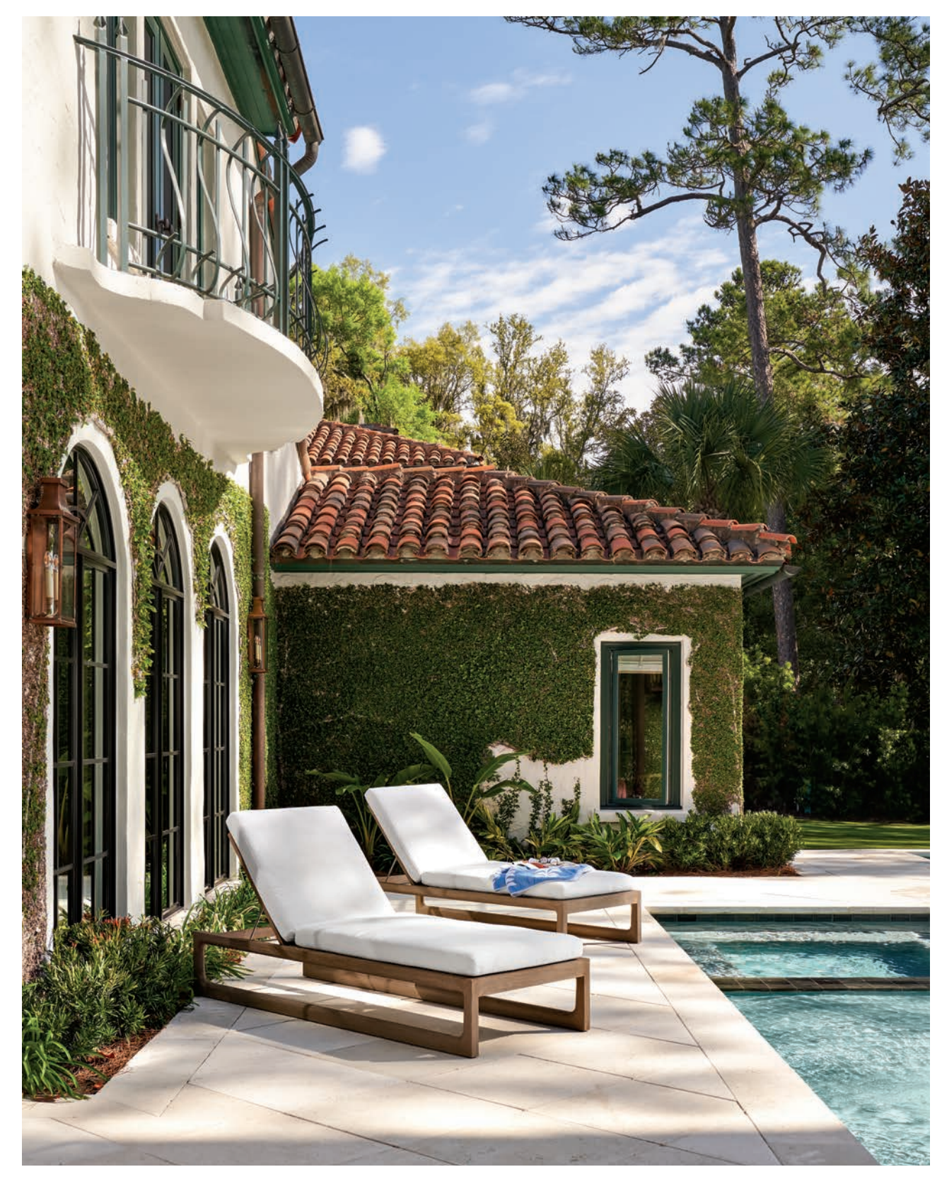
Above: To amplify outdoor living options, architect Josh Youngner incorporated an expanded pool terrace where RH lounge chairs compose an idyllic retreat. Poolside views can be better appreciated indoors, too, thanks to arched windows with narrow stiles by Marvin.

Opposite: Landscape architect Rachael Strickland reimagined these areas by incorporating new spaces suited to outdoor gatherings. Within a patio filled with native coquina shells, a teak lounge set by RH holds court with a ceramic garden stool from The Vine Garden Market.